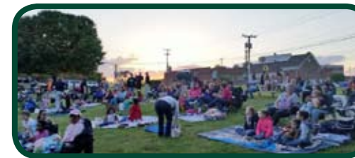
"Enjoyin' a night in Downtown at Movies on Main in Constitution Square!"