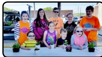
"Plant A Pot for Mom at the South Boston Farmers Market."

Promotions held in 2015 include two Movies on Main promotions held in May and July, bringing movies, popcorn, and family fun outside to the streets of downtown. A Summer Concert Series was held in May, June, and August, and the 24th Annual Harvest Festival was held in September. DDSB partnered with the Halifax County School System and held a Teacher Appreciation Day in September. In October, they partnered with Good Samaritan and held a Coat Drive and Food Drive. In November, they partnered with the Halifax County Chamber of Commerce and the Town of Halifax on Small Business Saturday. The 29th Annual Christmas Open House was held in November, and Christmas in the Caribbean was the theme for the South Boston Christmas Parade in December.