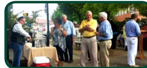
"Join us for fun, networking and more at Downtown Mixers!"

Your support is critical to the effort. The opportunity for community involvement as volunteers, financial supporters, and advocates will result in the comprehensive revitalization envisioned for Downtown South Boston.