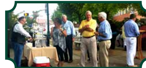
"Join us for fun, networking and more at Downtown Mixers!"

Your support is critical to the effort. The opportunity for community involvement as volunteers, financial supporters, and advocates will result in the comprehensive revitalization envisioned for Downtown South Boston.