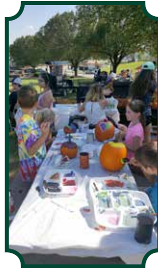
Pumpkin Painting fun at the South Boston Harvest Festival!

A Summer Concert Series was held in June and August, and the 25th Annual Harvest Festival was held in September. In November, we assisted the Veterans on a Veterans Day Parade and partnered with the Halifax County Chamber of Commerce and the Town of Halifax on Small Business Saturday . The 30th Annual Christmas Open House was held in November, and A Dr. Seuss Christmas was the theme for the South Boston Christmas Parade in December.