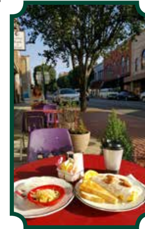
Enjoying breakfast downtown during Restaurant Week in September!