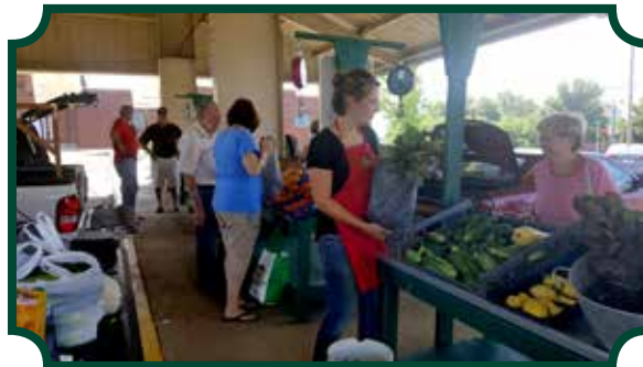
Enjoy the fresh produce available at the Downtown South Boston Farmer's Market!

DDSB assisted the South Boston Farmers Market . We served on the Farmers Market Event Planning Committee and held Farmers Market promotions including a Grand Opening in June, Thursdays in July, and Food Demonstrations. We