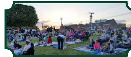
"Enjoyin' a night in Downtown at Movies on Main in Constitution Square!"